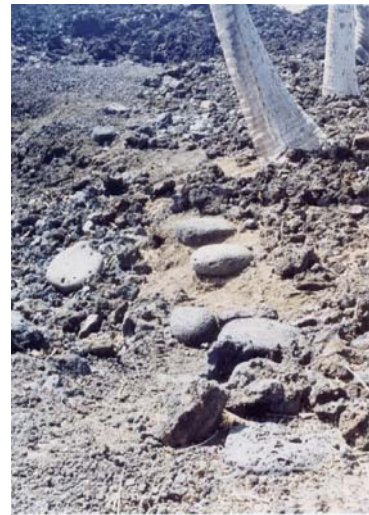
Trail has become unusable in sections.