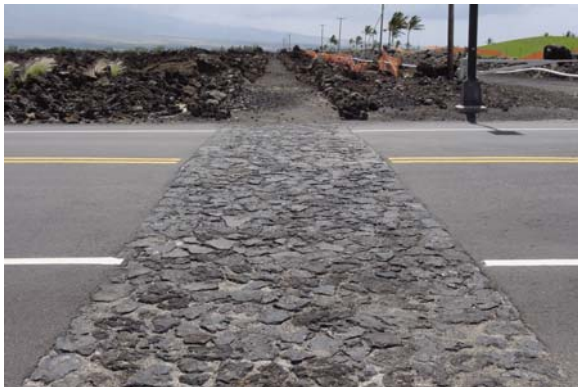
This is the preferred surface treatment. It mimics the authentic, historic surface while enabling road use.

The number and width of breaches should be minimized. The original location of the trail should be restored within the breach, using materials that mimic the historic trail surface. In this manner the breached section will be connected to the original trail on either side. Review of planned breaches by the Council is recommended. Planners and developers are encouraged to request time on Council agendas for that purpose.