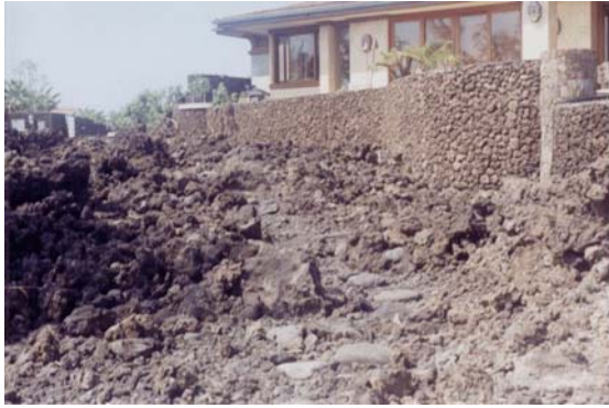
Although 15 ft. from the trail's center line, the rockwall and house dominate. There is little historic ambiance here.

Buffer widths vary. There are no standard widths. The council prefers widths of more than 15 ft., as measured from the trail's outside edges. This also applies to relocated and restored trails. Buffer widths are determined on a case-by-case basis and consideration is given to the archaeological integrity of the subject trail, surrounding environment, land uses, land ownership, and nearby natural and cultural features. The Council should be consulted early in the planning process.