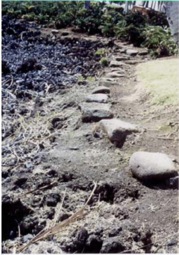
Wave action has eroded the soil around the `alā stepping stones.

When the trail is located in an area vulnerable to potential erosion, provisions for trail relocation in the event of trail erosion should be included in all trail-related agreements and approvals. This is in order to ensure that the negotiated trail will be usable forever. Water diversion techniques, i.e. waterbars, may need to be employed if water runoff is occurring or potential for soil erosion is present. Information on “Best Management Practices” (BMPs) to prevent or correct erosion problems is available through Nā Ala Hele.