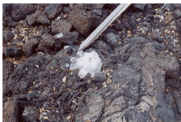
Property markers of various types are commonly found in historic trails and walls. This one is secured with cement within a historic trail. Such practices deface historic sites.