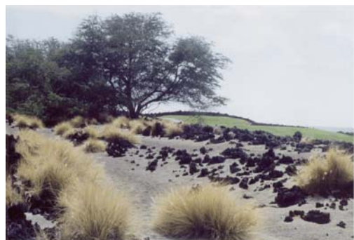
The wild kiawe can be a welcome contrast to the manicured golf course.