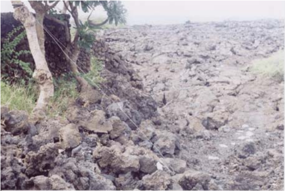
Guy wires were used to keep the plumeria tree from falling into the trail.

Plant surveys done prior to the area’s development can help to identify naturally occurring plants. Council members may be able to suggest resource people and sources for native plant materials.