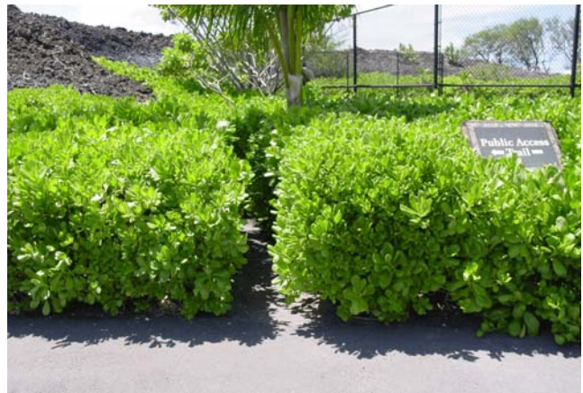
Naupaka is encroaching into the trail, making it impassable by more than one person at a time.