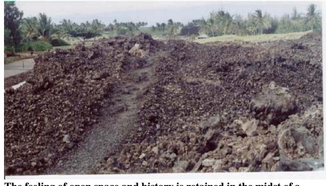
The feeling of open space and history is retained in the midst of a major resort when wider, natural buffers are present.