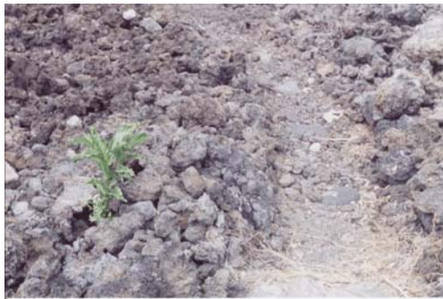
Native plants such as noni sprout on their own.

In most instances, it is better to retain the existing vegetation, especially plants that provide shade. It is preferred that no landscaping be done within trail buffers unless the plants chosen are native to the area. The trail itself should be kept clear of vegetation.