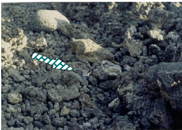
Note the property pin set into the historic trail.

It is essential to educate people about the significance of and proper behavior around trails and sensitive sites nearby. Signage can be effective in this regard. Interpretive signage planned for trails and adjacent sites should be reviewed by the Council. Check if standardized signage has been adopted for the particular area.